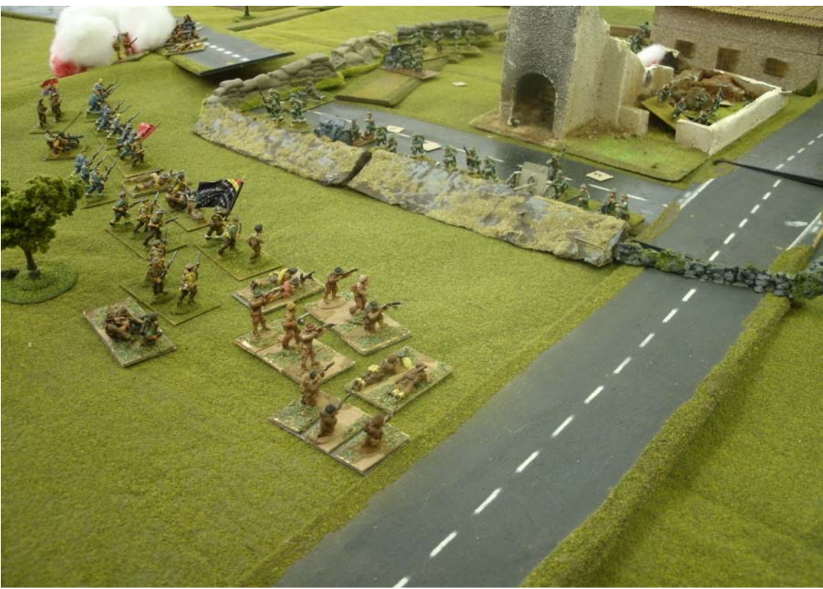
XII IB Closes on Brihuega-Movil de Choque Pounded in Background