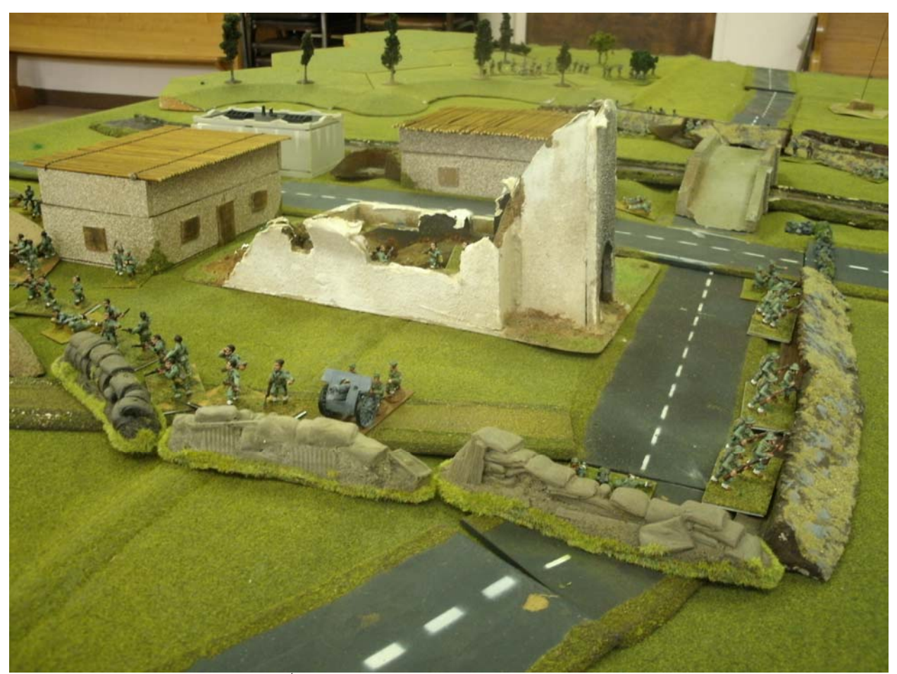
The 1<sup>st</sup> Blackshirt Legion Dug In At Brihuega

This game was based on a battle which essentially brought an end to the Italian Corpo de Truppi Voluntari offensive of March 1937. The CTV numbered four divisions (Littorio, 1^{st} , 2^{nd} , and 3^{rd} Blackshirt Divisions and various corps troops.) They were initially opposed on the 8^{th} of March by a handful of Republican Popular Army units. After several days of moderate success they were checked by Republican reinforcements and a massive commitment of Russian Air and Armor.