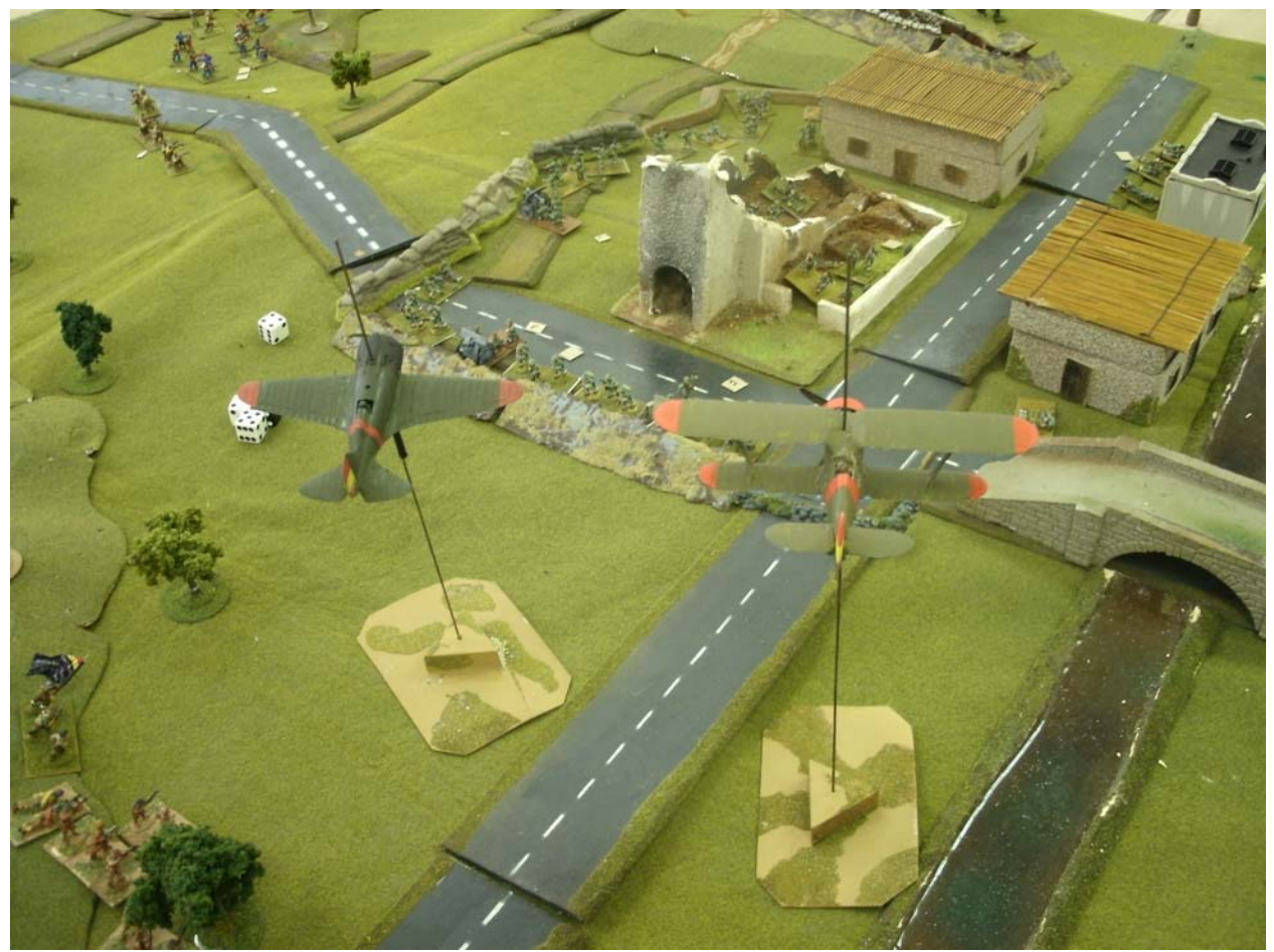
The fighters, instead of circling around, emptied their machineguns into the town. The bombers had finished their work without coming within range of the Italian AA battery. But the fighters weren't so lucky. Several were brought down on the way out.

At that point the armor (in two packets) started moving out of the woods, the nearest Carabineros battalion moved on the right flank of the 6^{th} Legion and set to work trying to offset the entrenchments of the CTV with their superior weapons skills. The sudden realization that the 6^{th} Legion was facing a massive armor attack changed CTV artillery priorities. All the off board guns changed targets and started shooting at the tanks. But ranging tanks is so difficult that some of the shots fired at the lead companies fell on the rear companies. The attack continued.