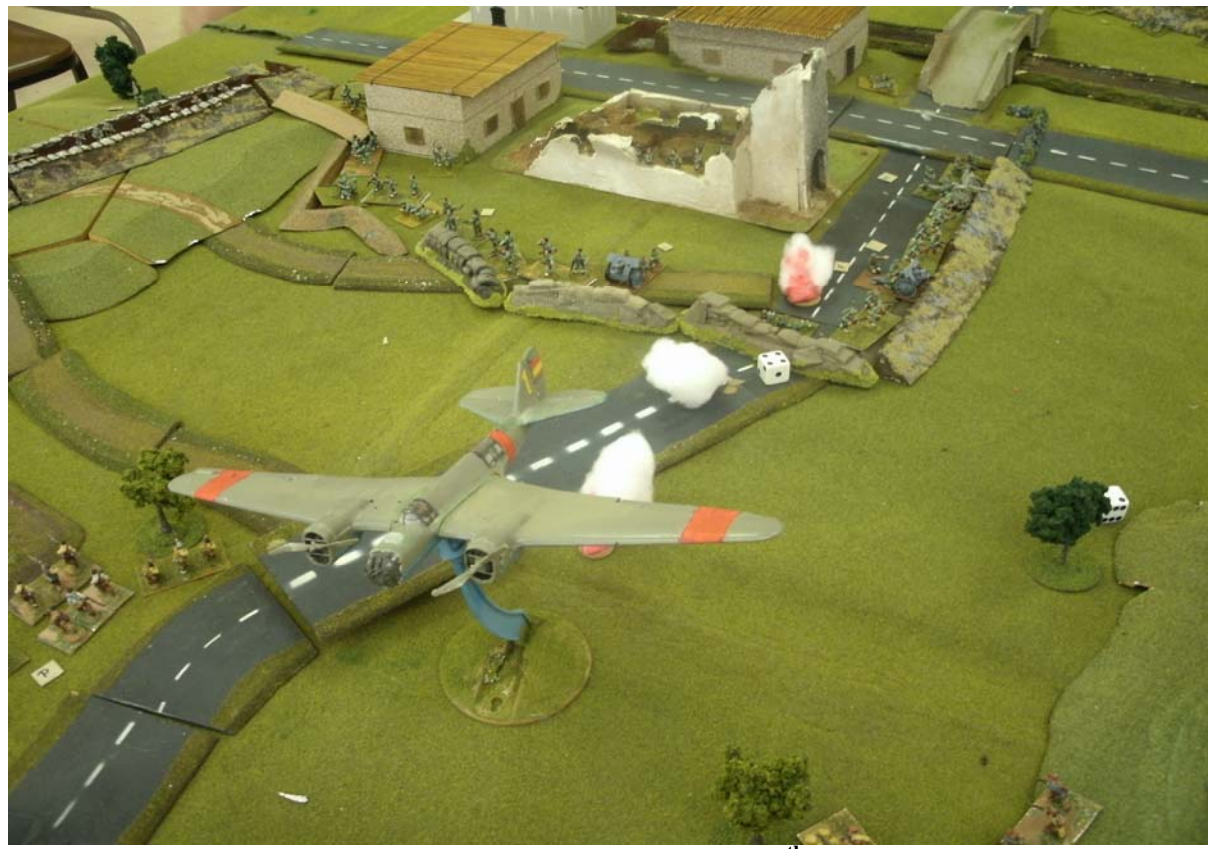
And the R-5 attack was directed at the lines of the 6<sup>th</sup> Legion over the Tajuna