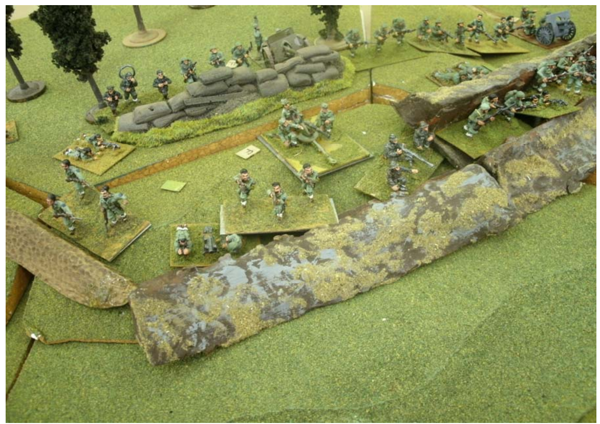
The 20mm Automatic AA Battery Made a Bad Situation Worse